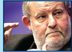
Mr Clarke says migrants are vital for the UK economy

Home Secretary Charles Clarke recently told MPs migrants were vital for the UK economy and society but it needed controls. The plans include fines for employers using illegal workers.